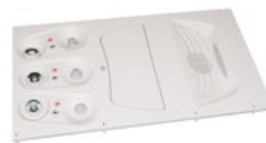
Goodrich Hella Aerospace system using ULTEM™ resin