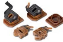
Wall panel fastener in ULTEM™ 2400 resin