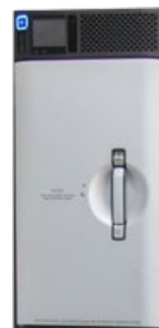
Galley component from ULTEM 1000F and 2300F resin