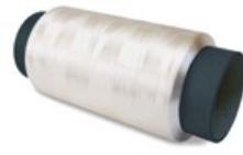
Fibers with ULTEM 9011 resin