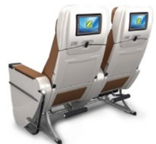
Personal units in colored ULTEM 9085 resin