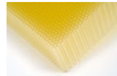
Composites with ULTEM 1000 resin