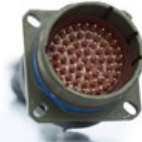
Connector in EXTEM XH2115 resin