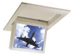
Infotainment systems in ULTEM 9085 resin