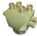
Air duct with ULTEM 9085 resin