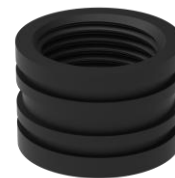
Insert for pipe fitting